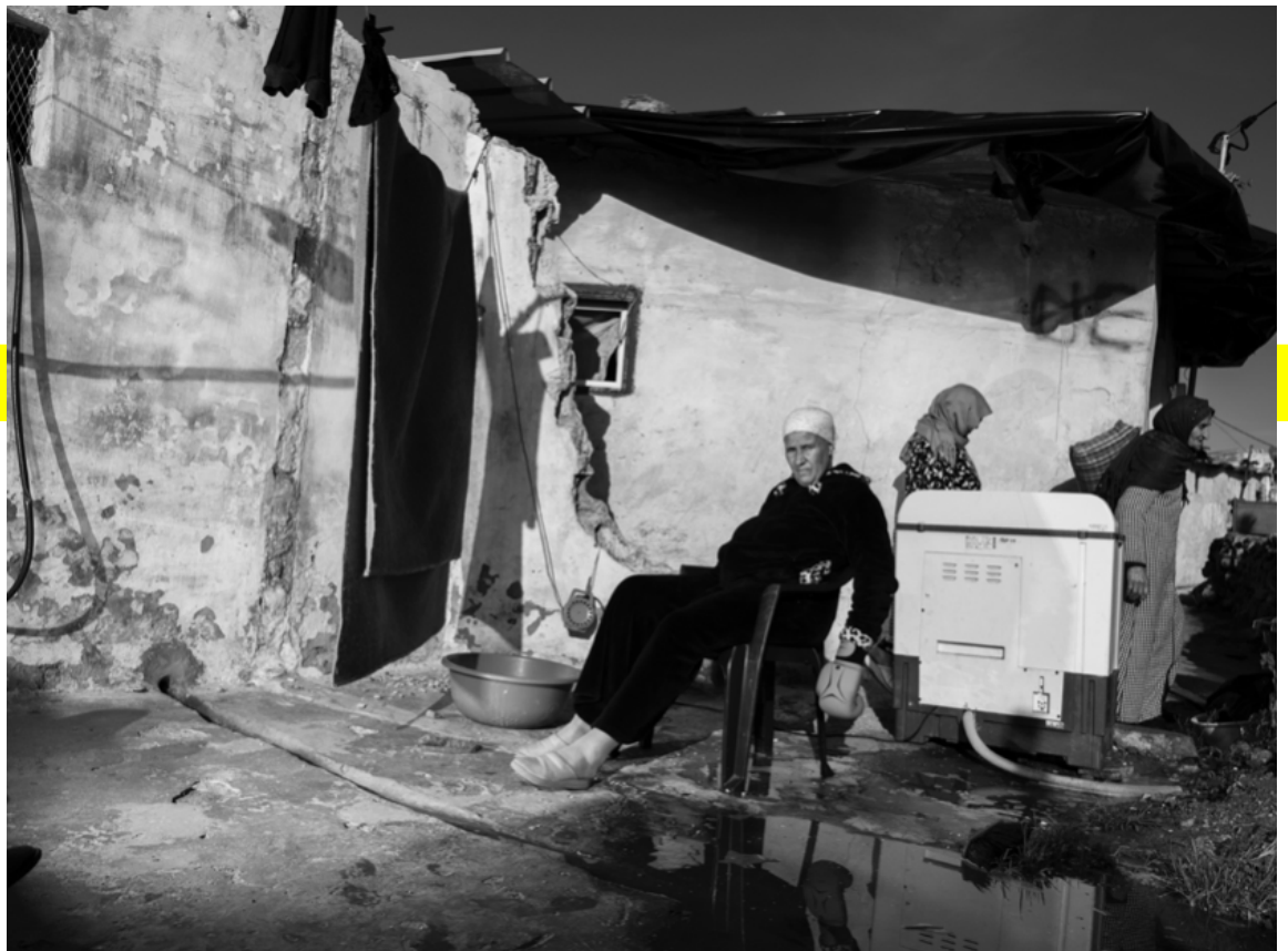
Mera O Ness